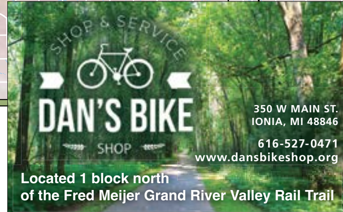
1 Location on map.

The trail officially begins at the Prairie Creek bridge east of Ionia and crosses over the Maple River east of Muir. It then travels through the heart of Michigan farm country before it crosses the headwaters of the Maple River in Ovid on its way to Owosso. A thick hedge of trees shelter the trail most of the way. At Smith Road, west of Owosso, a signed, designated bike route guides you into downtown Owosso. Trail planners envision future rail trail extensions to downtown Owosso and east to Durand.