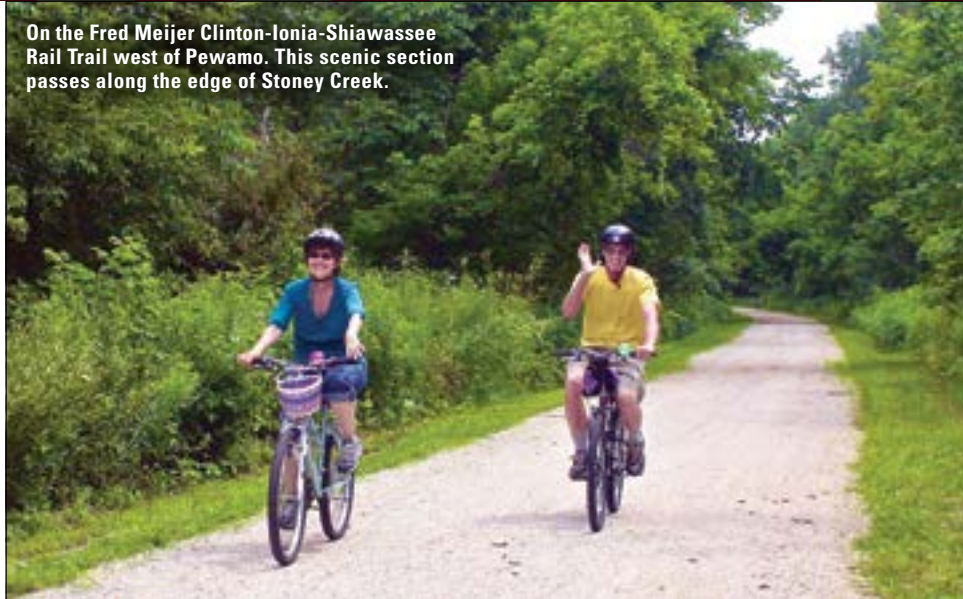
On the Fred Meijer Clinton-Ionia-Shiawassee Rail Trail west of Pewamo. This scenic section passes along the edge of Stoney Creek.

The trail surface consists of about one mile of asphalt pavement through Saranac, and about 3.75 miles of pavement through the city of Ionia, with the rest of the trail in between surfaced with finely screened and compacted crushed limestone. A new trailhead in Saranac was completed in 2019 next to the river, across the street from the Saranac depot and historical museum, offering a great spot to relax or enjoy a picnic. In downtown Ionia, public parking is available on Adams Street, one block east of the M-66 bridge. Saranac and Ionia offer plenty of stores and eating establishments near the trail.