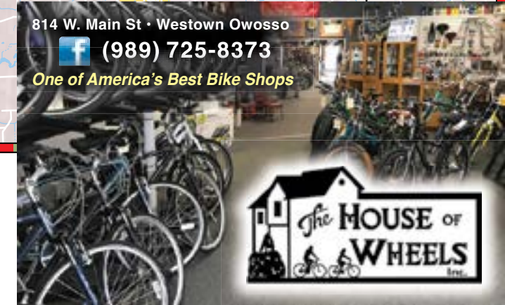
2 Location on map.